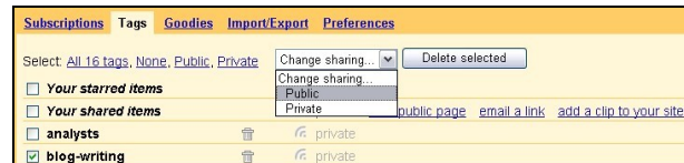
Figure 4 - Google Reader Public Feed

Select Tags, Figure 4, and select the tag and change it to Public. This will generate the RSS feed for the tag.