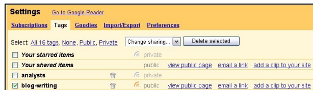
Figure 5 - Google Reader View Public Page or Add a Clip to Your Site

Click on “View Public Page”, Figure 5, to see all the articles that you have tagged with that specific tag. On the right side of the page is an RSS feed labeled “a feed”, Figure 6, with an RSS icon by it.