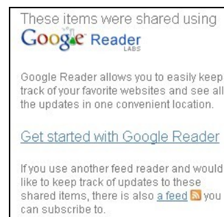
Figure 6 - View Public Page - RSS Feed

I use the “None” setting for formatting the clip when adding it to WordPress themes. This way the formatting from the clip doesn’t interfere with the theme. Experiment and see what works for you.