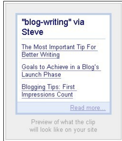
Figure 1 - Tag Generated RSS Widget