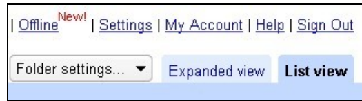
Figure 3 - Google Reader Settings

You need to make the tags public so Google will generate an RSS feed for the tags. At this time Google does not support tags for private feeds.